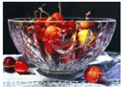
Cherries and Reflection Soon Y.Warren Juror of Selections

NOTE: You may submit one or two images, but no more than one entry per artist may be selected for exhibition.