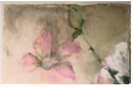
Kara Coleman, "Subtle Spring," Watercolor

View the online gallery here: https:// fallbrookartcenter.org/catalog.php?CatalogID=16