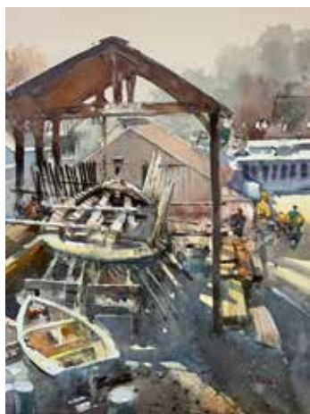
Stewart White JUROR OF AWARDS

22 inches x 30 inches Transparent watercolor $4,500.00