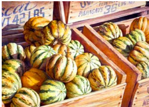
(right) Lana Privitera, They've Got Some Curves