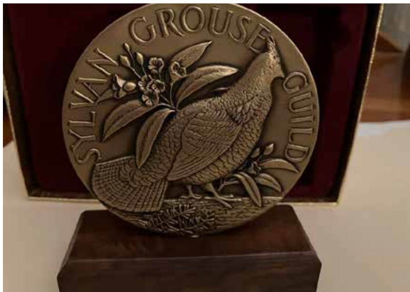
The Sylvan Grouse Guild Award Medal