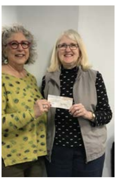
Dillsbury Art Council

To apply for these grants, go to the PWS website, www.pawcs.com. Under the Resources menu, select Educational, then Grants for the application. The application can be completed online. The PWS Board will then review and consider it. These grants are restricted to registered non-profit organizations.