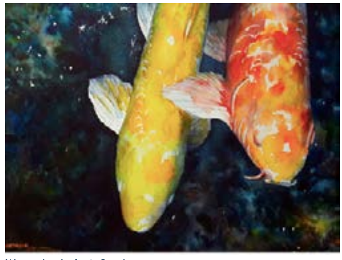
Watercolors by Annie Strack