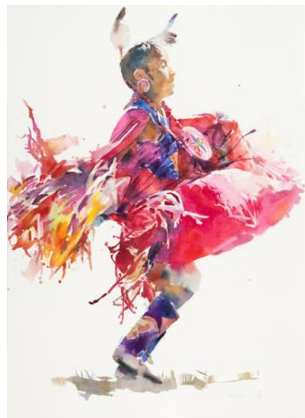
PowWow—Girl in Pink, 22 x 30 By Stephen Zhang