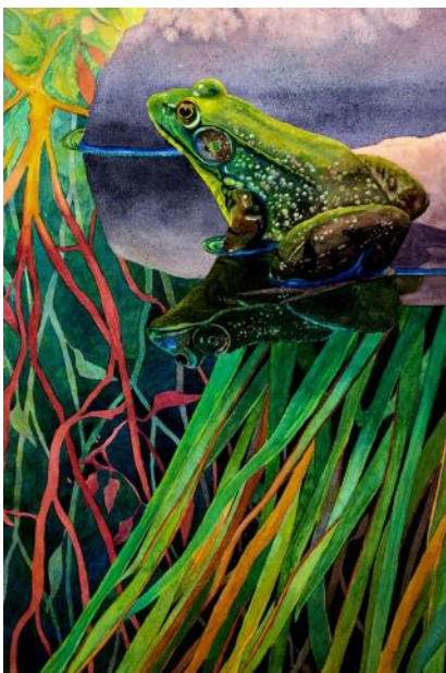
"King of the Pond" by Ann Hart, PWS